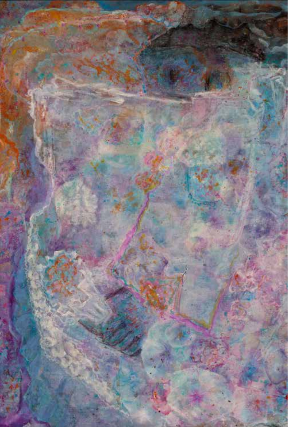
Detail from Patriarch by Kahlil Gibran