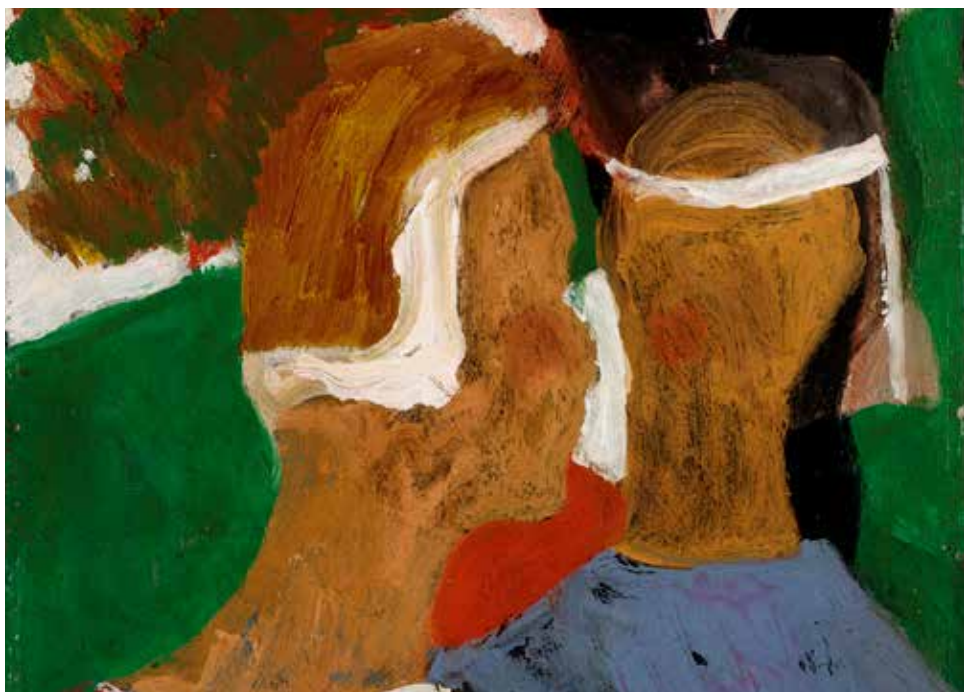
Detail from untitled (two brides) by Bob Thompson