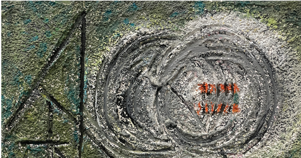
Detail from Energy Field 1

Her work resides in many private and public collections including the Fiduciary Trust of Boston, Lifeline Systems and the Provincetown Art Association and Museum.