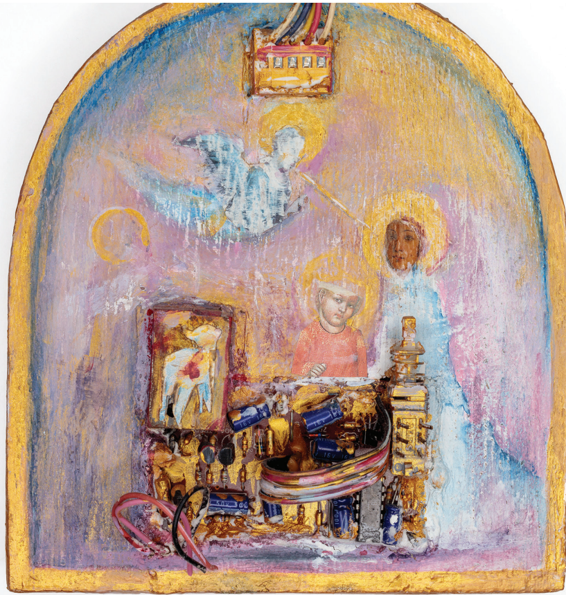
Detail from Annunciation