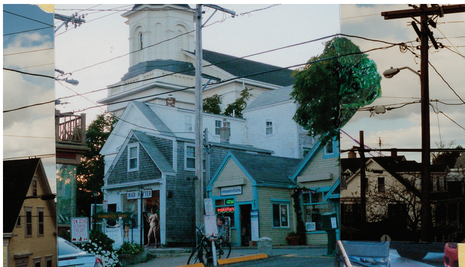
Detail from Embedded 15: Fat Lady Torso at Mad Hatter at Sunset

Fragmentary Phantasies in the Roman Forum and Palatine: MCMLXII , 7/20, 1962 Etching, 11.75" x 14.50" Courtesy of the artist