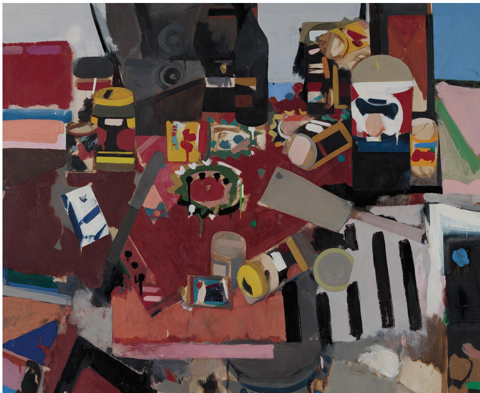
Detail from Still Life with Black Vase and Red Cloth

who were thought to live in lesbian matriarchies, Kogan's Amazons are strong warrior-like women of legendary stature, athleticism, and aggression.