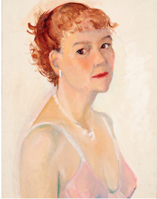
Josephine Hopper, Untitled (Self-Portrait)

Vincent Van Gogh made 30; Frida Kahlo, 55. Rembrandt van Rijn's are thought to number in the dozens (since his apprentices often copied them, it is hard to be certain).